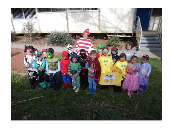
Book Parade 2013 Kindergarten