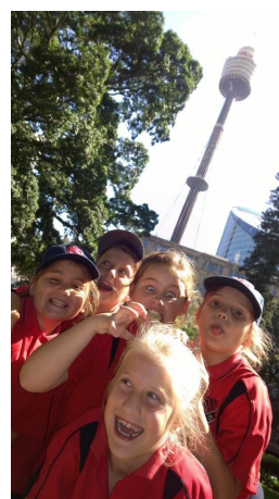
Sydney Tower Excursion