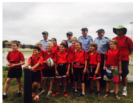
Cops and Kids